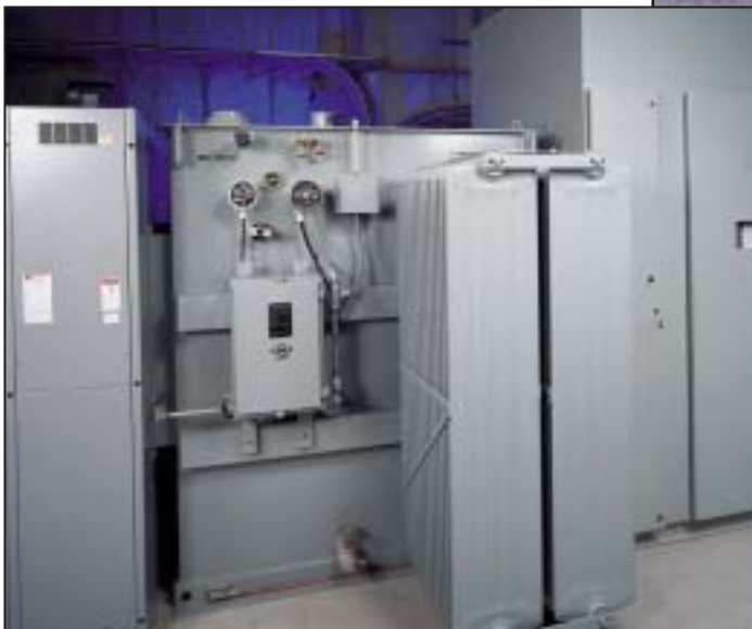
Envirotran transformers will serve Miller Park—Home of the Milwaukee Brewers National League Baseball Team.

When you specify the Code-Listed FM Approved Envirotran transformer, you choose a practical and more dependable solution. Typically, there is no need for a fire vault, automatic sprinklers, or special clearances. The "FM Approved" transformer designs come with a special nameplate listing the transformer's protective devices and other compliance requirements, so the on-site inspector can easily and quickly verify code compliance for both indoor and outdoor installations. For additional information on Code compliance, request the NEC/NESC Requirements Guideline, Cooper Power Systems, Bulletin 92046.